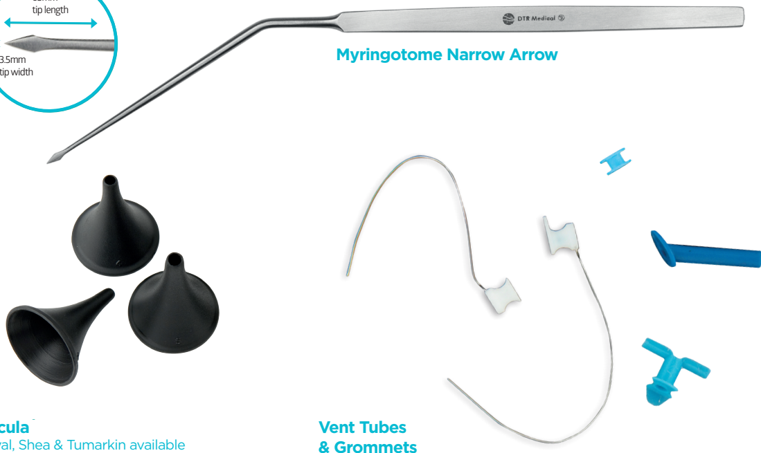
Myringotome Narrow Arrow